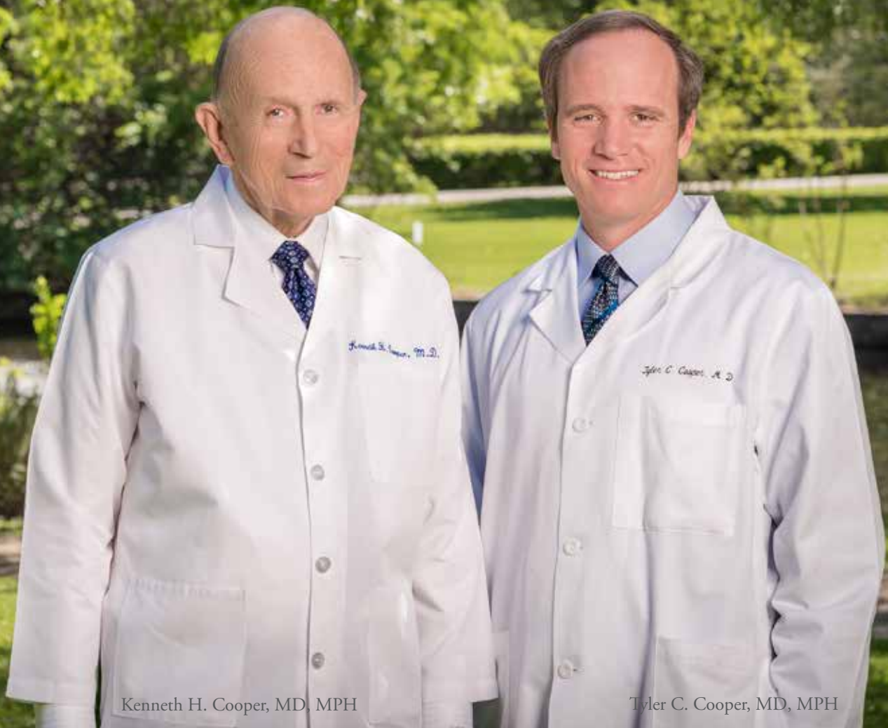
Kenneth H. Cooper, MD, MPH